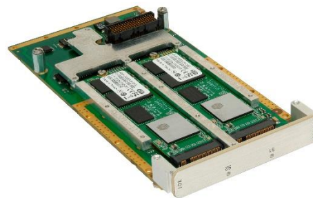
Air-cooled Build Option: 2 x M.2 Devices Fitted