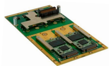
Conduction-cooled Build Option: 2 x M.2 Devices Fitted